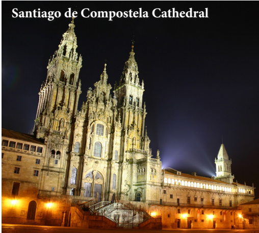
Santiago de Compostela Cathedral